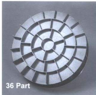
Weight range: 1 - 4 oz.

You can divide and round dough pieces from 1 to 21 ounces using the heads listed below. Changing heads, or removing them for washing in sink or pan washer, takes only a couple of minutes. Heads are made of light weight aluminum casting. Head and knives are teflon-coated to work with sticky doughs